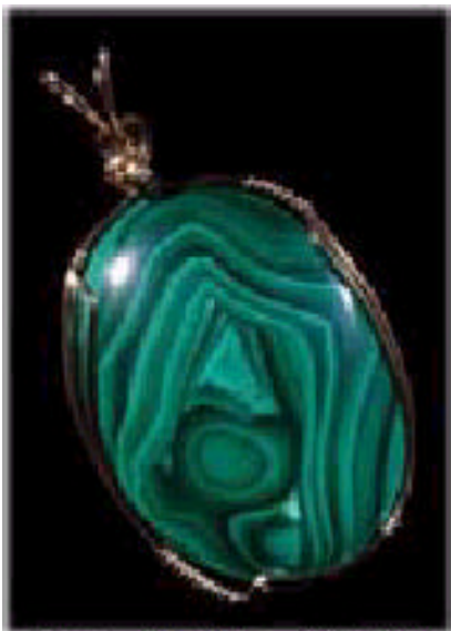
Malachite Cab (30x40) Wire-wrapped - 14K Gold