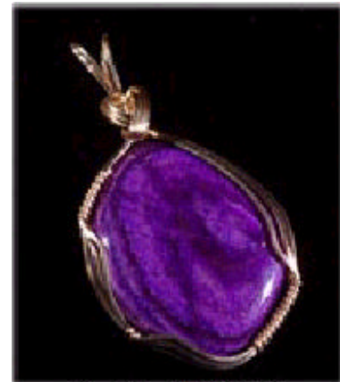
Sugilite Cab (30x40) Wire-wrapped - 14K Gold

•Sugilite cabochon 30x40mm wire-wrapped in 14K gold. Made and donated by Al DeMilo, GLMS/DC. Wire-wrapped in 14k gold by Russell Shew, Designs Unlimited and GLMS/DC. Value $100.