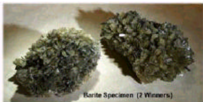
Barite Specimen (2 Winners)