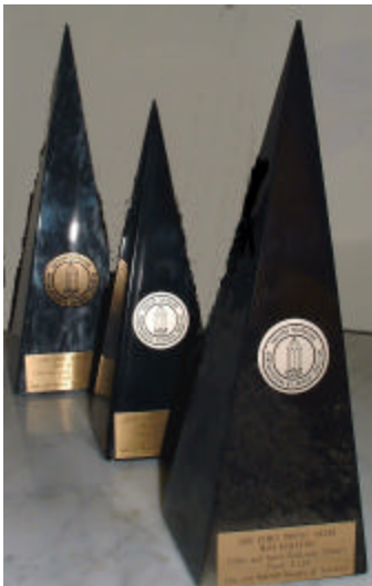
1999, 2000, & 2001 EFMLS Trophy Winning Newsletter