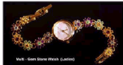
Multi - Gem Stone Watch (Ladies)