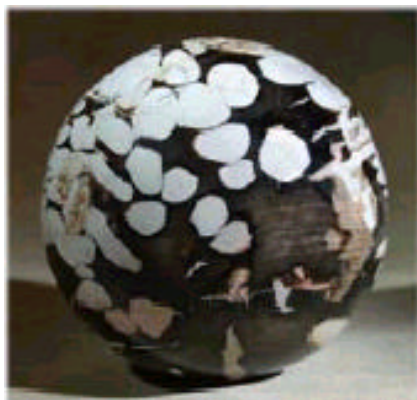
4 inch Peanut Wood Sphere from Australia